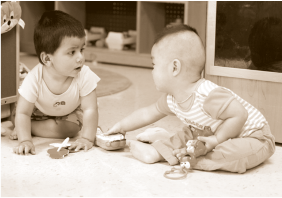
Experiences for infants and toddlers are now being designed with the infant's developing sense of self in mind.

of self-worth and the ability to have positive social relationships later in life.