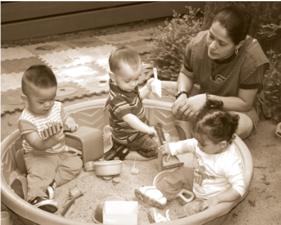
Infant care teachers are caring facilitators of the child's journey toward emotional, cognitive, language, physical, and social competence.

described important differences between how babies learn in comparison to older children (2009b). According to Gopnik, adults mistakenly believe that infants learn the same way school age children do. In school, adults set objectives and goals for children and try to get the children to focus on the skills and content they should master. However, research shows that baby learning is different. “Babies aren’t trying to learn one particular skill or set of facts; instead, they are drawn to anything new, unexpected or informative” (p. WK10). Gopnik’s research shows that infants are not very good at planned focus but very good at the exploration of the real world objects they are interested in and interaction with the people around them. She concludes that “Babies are designed to explore and they should be encouraged to do so” (p. WK10).